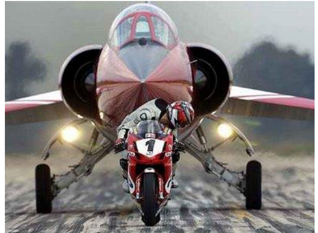
Tailgating can be real pain in the A**!