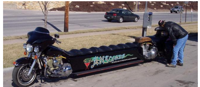
Could you rent this out for parties?