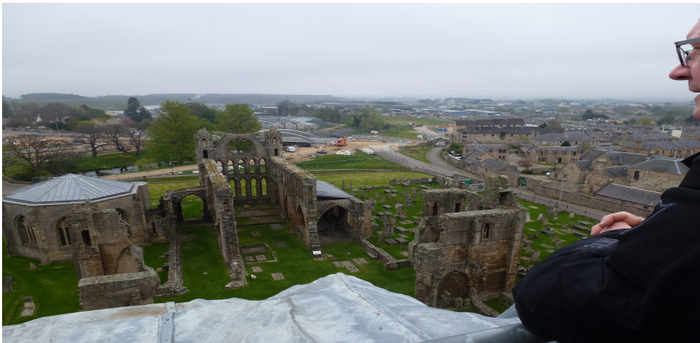
VIEW FROM THE TOP OF THE TOWER AT ELGIN CATHEDRAL

Next morning, after a well cooked breakfast we rode to Elgin Cathedral and took a wander around.