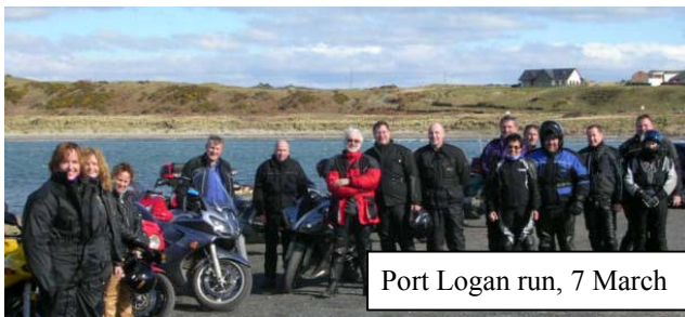
Port Logan run, 7 March